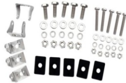
BOTTOM BRACKET MOUNTING KIT